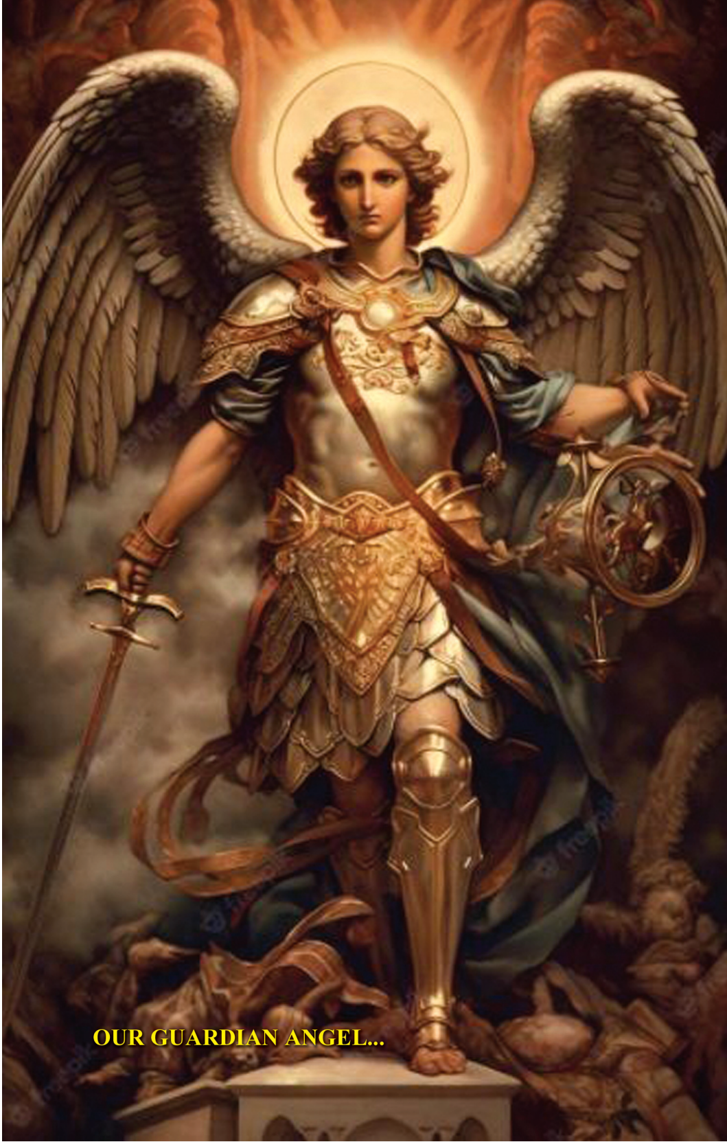
OUR GUARDIAN ANGEL...