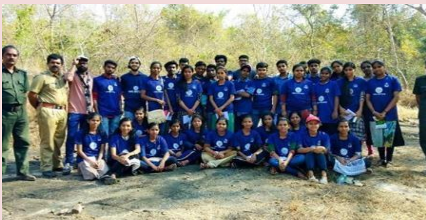
Republic Day Parade Camp 2019