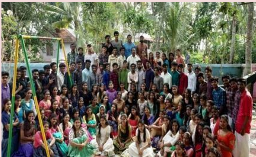
ACTIVITIES OF WOMEN CELL

The annual special camp of the year 2018-19 was conducted from 24.12.2018 to 30.12.2018 at BSMM Nirmal School, Thanneermukkom. The objective of the camp was Zero Waste Village. The camp was organised in association with Thanneermukkom Grama Panchayat and Suchitwa Mission.