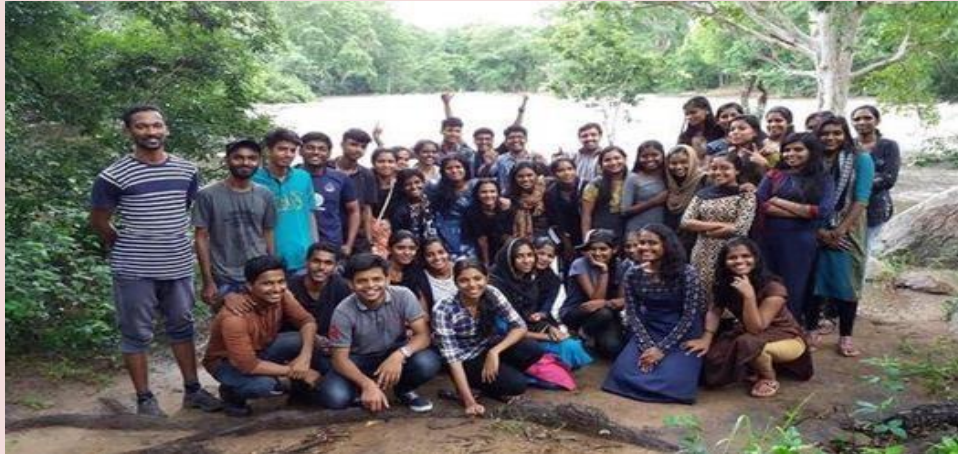
Nature Camp Shendurney Wild Life Sanctuary