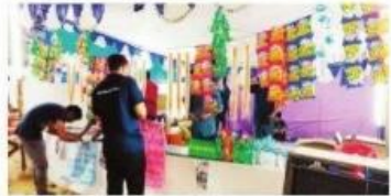
രോഗാതുരയായ അമ്മയും വിദ്യാർത്ഥികളായ രണ്ട് പെൺകുട്ടികളും അടങ്ങുന്ന നിരധന കുടുംബത്തിന് വീടൊരുക്കാൻ സെന്റ് മൈക്കിൾസ് കോളേജ് വിദ്യാർത്ഥികൾ സന്നദ്ധ പ്രവർത്തിക്കുകയാണ്.

★ ആലപ്പുഴ: രോഗാതുരയിടയാക്കിയ അമ്മയും വിദ്യാർത്ഥികളായ രണ്ട് പെൺകുട്ടികളും അടങ്ങുന്ന നിരധന കുടുംബത്തിന് വീടൊരുക്കാൻ ഐസ്ക്രീം കടയുമായി സെന്റ് മൈക്കിൾസ് കോളേജ് വിദ്യാർത്ഥികൾ കോളേജിലെ നാക്കൗണ്ട് സർവീസിൽ കീം മുഴങ്ങിക്കളയുകയായതു കൂടെ സെന്റ് മൈക്കിൾസ് കോളേജ് ഐസ്ക്രീം സ്റ്റാൾ 17 മുതൽ പ്രവർത്തിക്കുകയാണ്. പകരം എത്തിച്ചേരുന്നത് ആനുകൂല്യം കൈമാറുകയും സഹായം നേടുകയും ചെയ്യാൻ സന്നദ്ധ പ്രവർത്തിക്കുകയാണ്. ഇതര ഐസ്ക്രീം സ്റ്റാൾ സന്നദ്ധ പ്രവർത്തിക്കുകയാണ്. ഇതര ഐസ്ക്രീം സ്റ്റാൾ സന്നദ്ധ പ്രവർത്തിക്കുകയാണ്. ഇതര ഐസ്ക്രീം സ്റ്റാൾ സന്നദ്ധ പ്രവർത്തിക്കുകയാണ്.